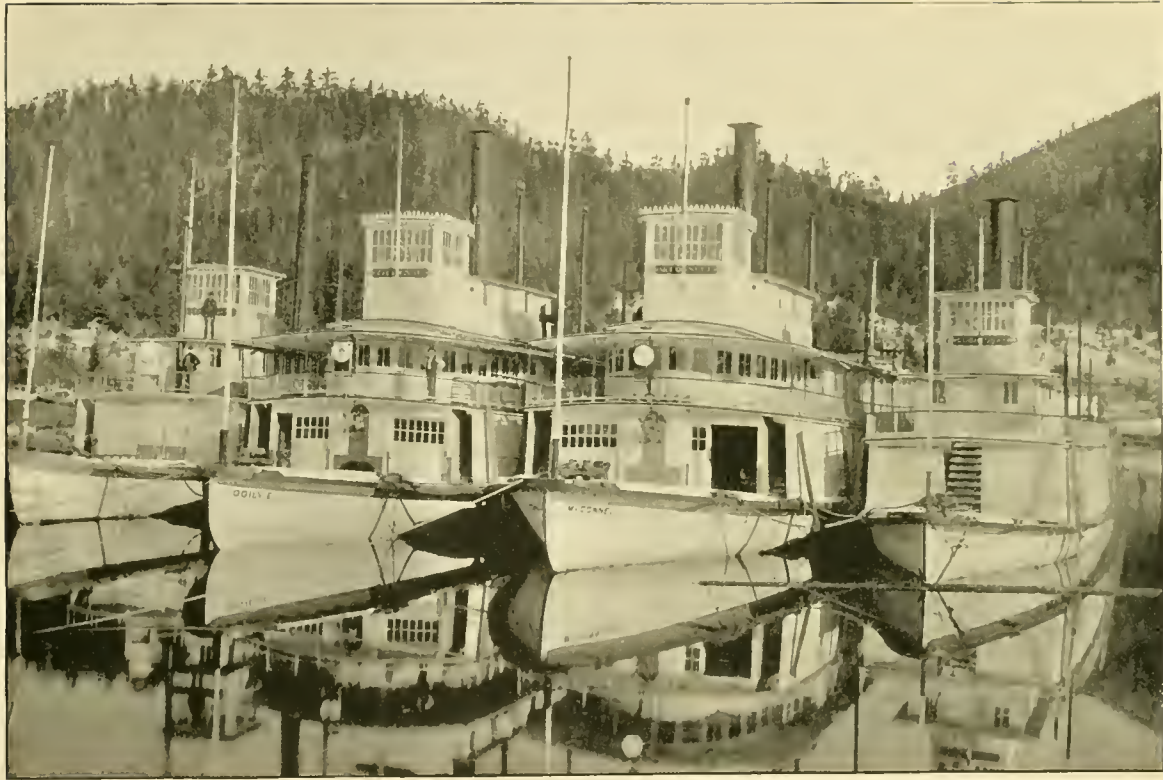
The Stickeen Fleet in Winter Quarters.